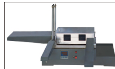
sample feeding and positioning device (included)