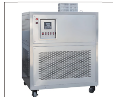
low-temperature chamber (optional)